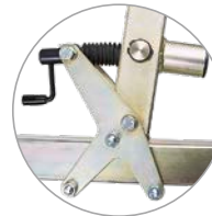
Wire can be easily inserted and tensioned