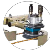
Standard hydraulic drive motor