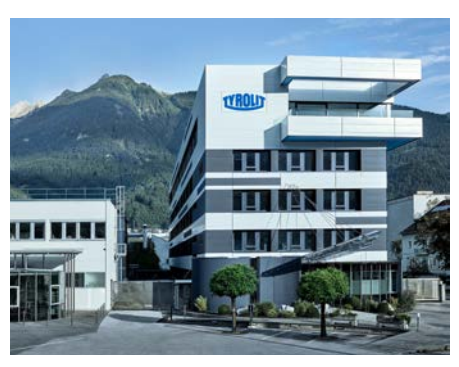
TYROLIT headquarters in Schwaz (Austria)

Headquartered in Schwaz (Austria), the familyowned business combines the strengths of being a part of the dynamic Swarovski Group with a century's worth of individual corporate and technological experience.