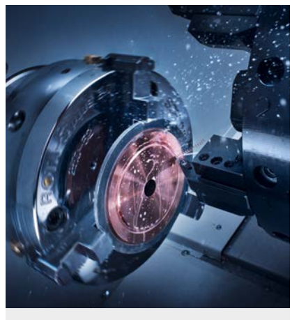
Technology leader in precision grinding — We are one of the worlds leading providers of high-precision grinding tools in the automotive, turbine and tooling industry as well as in various other precision industries.