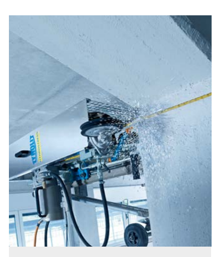
Creator of innovative wire sawing technology — We strongly pursued the development of the wire sawing technology for applications in the stone and construction industry which is still the industry reference today.