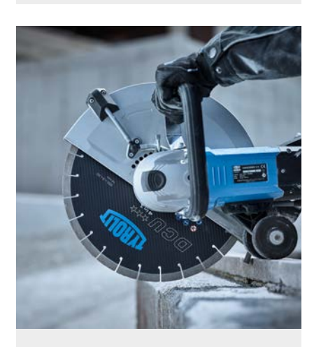
Leading solutions for construction professionals — Our innovative system solutions and the patented diamond technology (TGD®) set new standards in performance and comfort for applications in the construction industry.