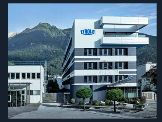
The TYROLIT headquarters in Schwaz, Austria.

Since 1919, the sustainable handling of resources, the assurance of a safe working environment and compliance with legal requirements have contributed to the company's lasting positive business development.